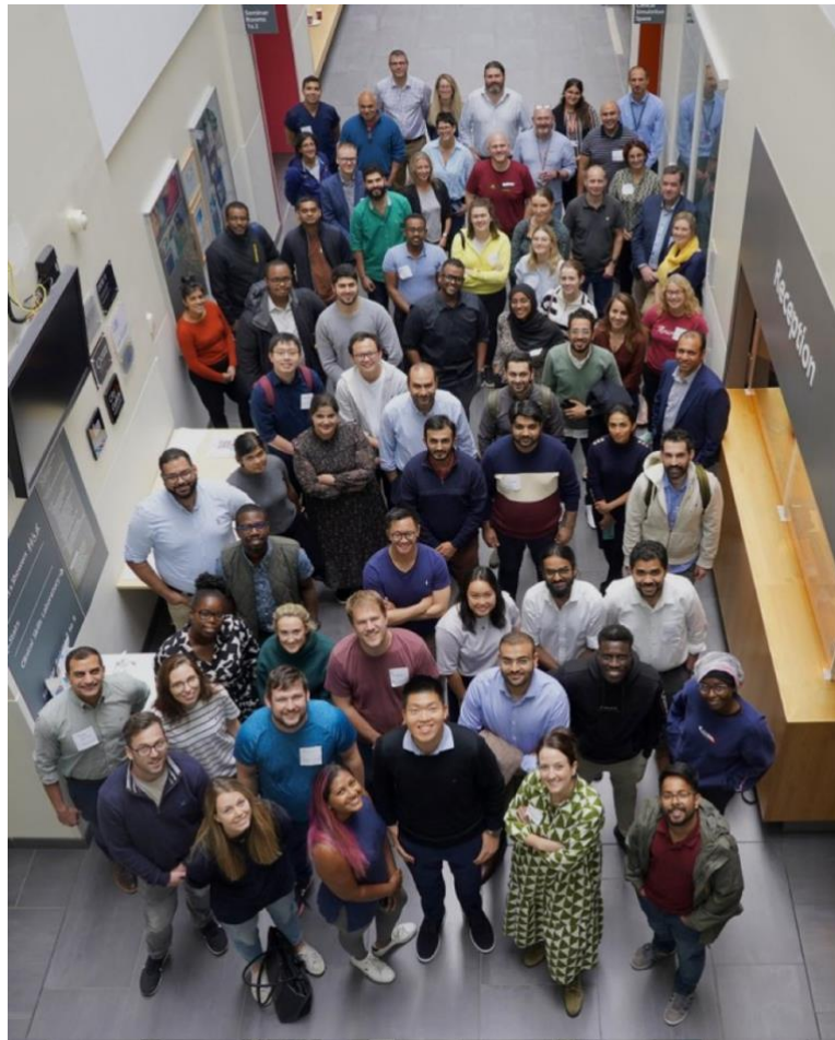
ASPIRE 3 Delegates and Faculty