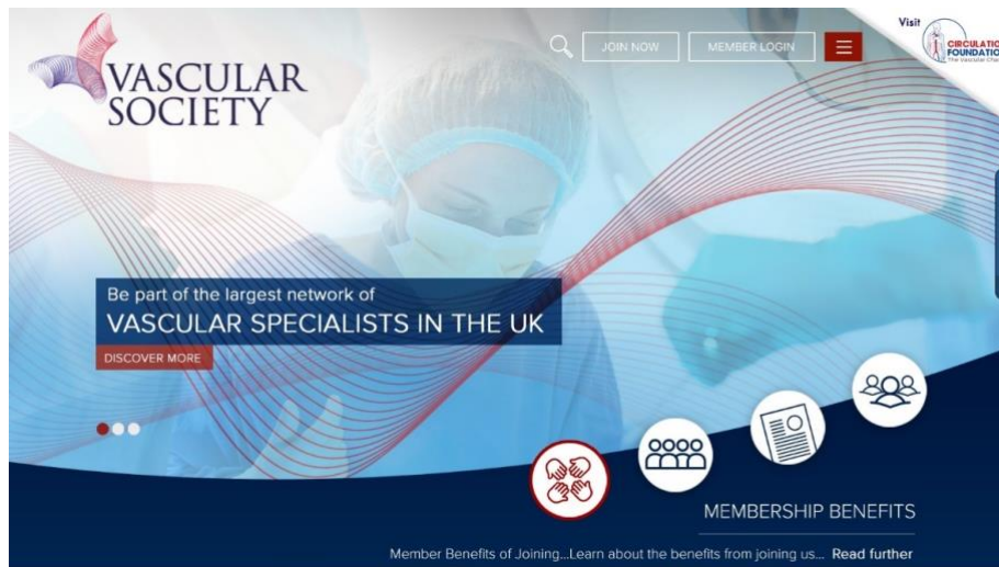
Front page design for new Vascular Society website (© Lightmedia 2023)